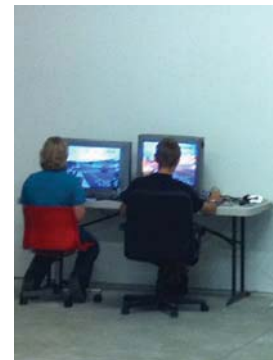
Counting stations in use

This center immediately increases our internal capacity for data reduction, and also improves our "production line" ability, as efficiencies are gained from operating on both coasts. This has been made possible entirely through the continued support of our customers around the nation; you've allowed us to expand, create new jobs in our local markets, and continue to look to the future. Thank you!